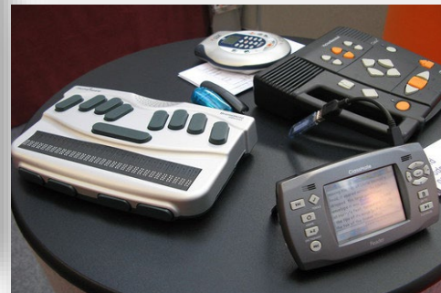
"Assistive technology gadgets"